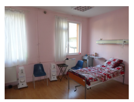
Photo: Plasmacluster ion device experimental installation in the hospital room

All experiments using 140 Plasmacluster ion devices were conducted on a designated floor inside the Tuberculosis Hospital where the ion concentration was kept at an average of 100,000/\text{cm}^3 .