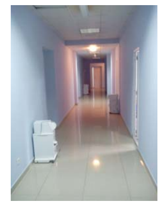
Photo: Plasmacluster ion device experimental installation in the hospital corridor